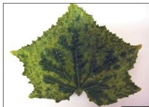
Interveinal chlorosis observed. Leaves will sometimes look puckered and distorted