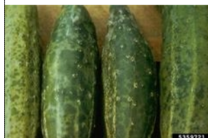
Cucumber fruits showing symptoms of infection with Cucumber Mosaic Virus (CMV)