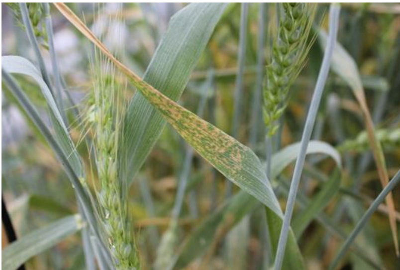
Panel 3: Ozone damage on a wheat leaf. Note the still visible veins.